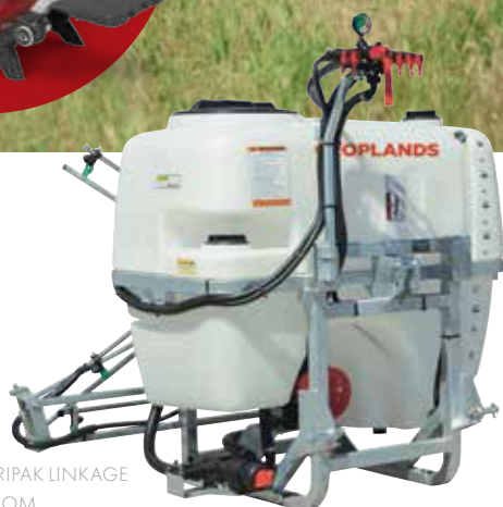
600L AGRIPAK LINKAGE WITH BOOM