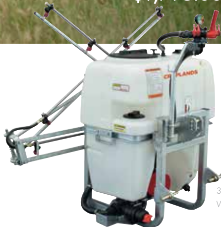
300L AGRIPAK LINKAGE WITH BOOM