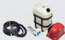
A5200052 FOAM MARKER